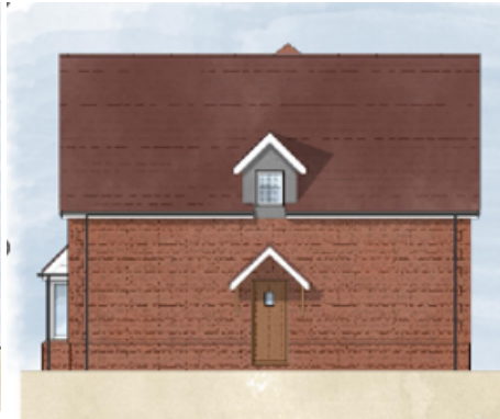
SIDE ELEVATION B