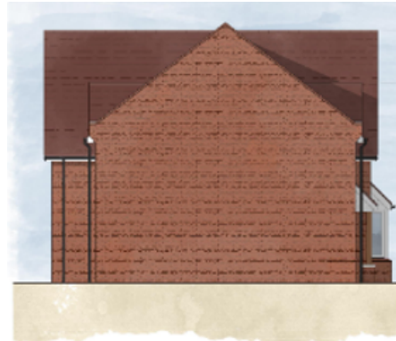
SIDE ELEVATION A